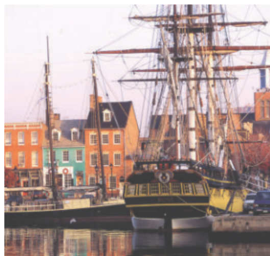
After Ellis Island, Baltimore's Fell's Point neighborhood served as the second-largest point of entry for immigrants to the U.S.

The show begins at 7 pm on February 24, and will last approximately 45 minutes. The address is: 17 E Mt Vernon Place. Please arrive at least 30 minutes prior to the performance. Entry is free for NISO Plus Attendees. Space is limited. RSVP to nisohq@niso.org .